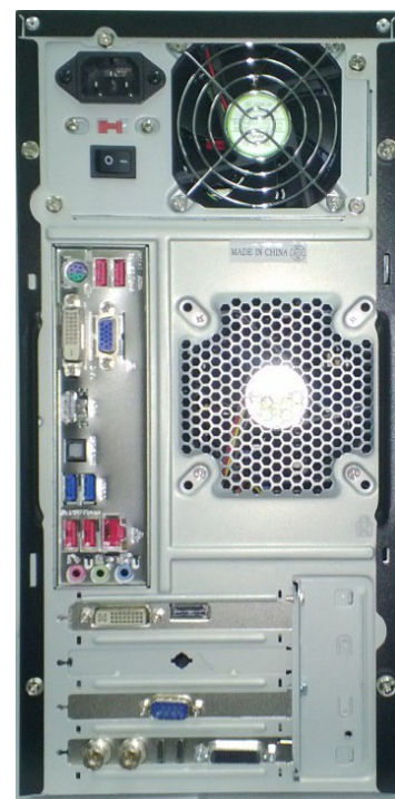
ChyTV HD 250